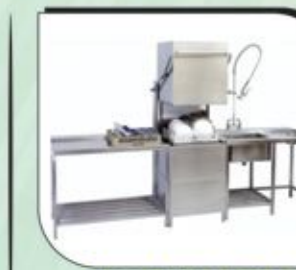
Hood Type Dish Washer