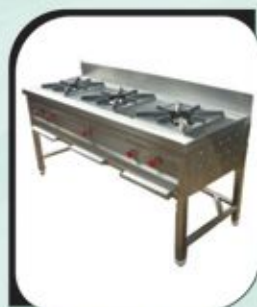
3 Burner Ranger