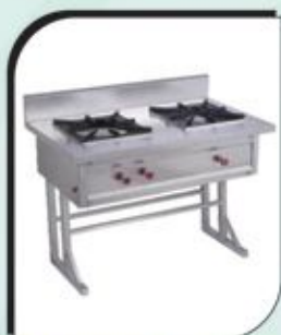
2 Burner Ranger