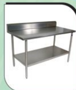
S S Work Table