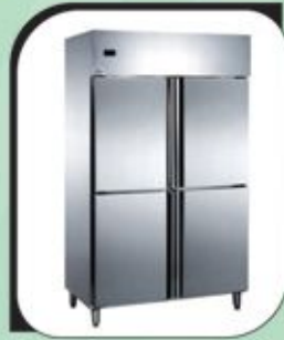
4 Door Freezer