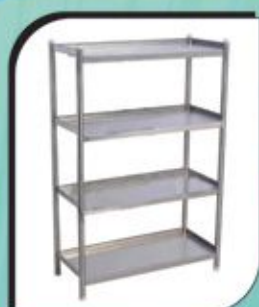
Clean Dish Rack