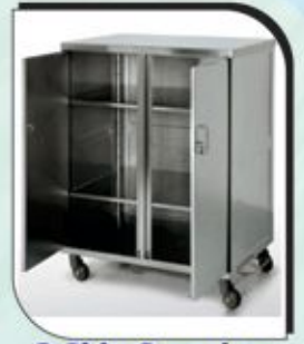
3 Side Covering Box Trolley