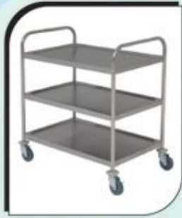
3 Tier Trolley