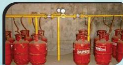
Gas Pipe Line Fitting