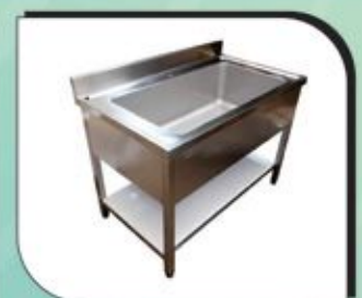
Pot Wash Sink