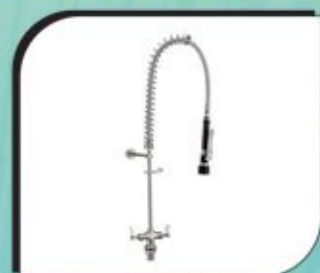
Pre Rinse Unit