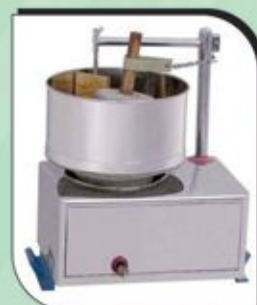
Conventional Wet Grinder