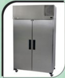
2 Door Chiller