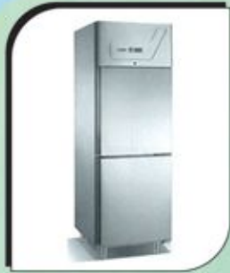
2 Door Freezer