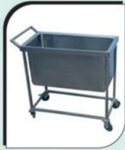
Wast Collection Trolley