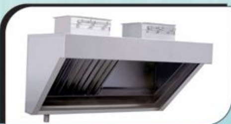
S S Exhaust Hood With Oil Filter