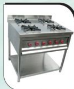
4 Burner Ranger