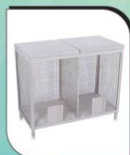
Onion & Potato Bin