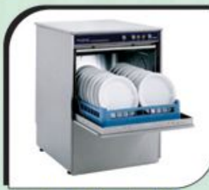
Under Counter Dish Washer