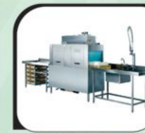
Conveyor Type Dish Washer