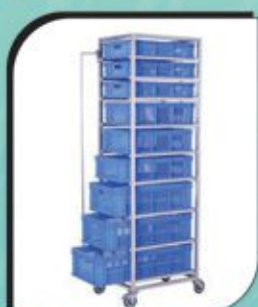
Vegetable Storage Rack